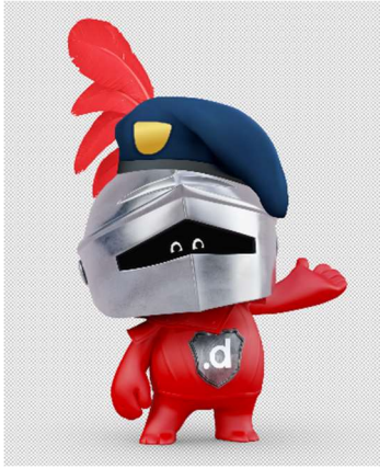
BELAIR DIRECT INSURANCE