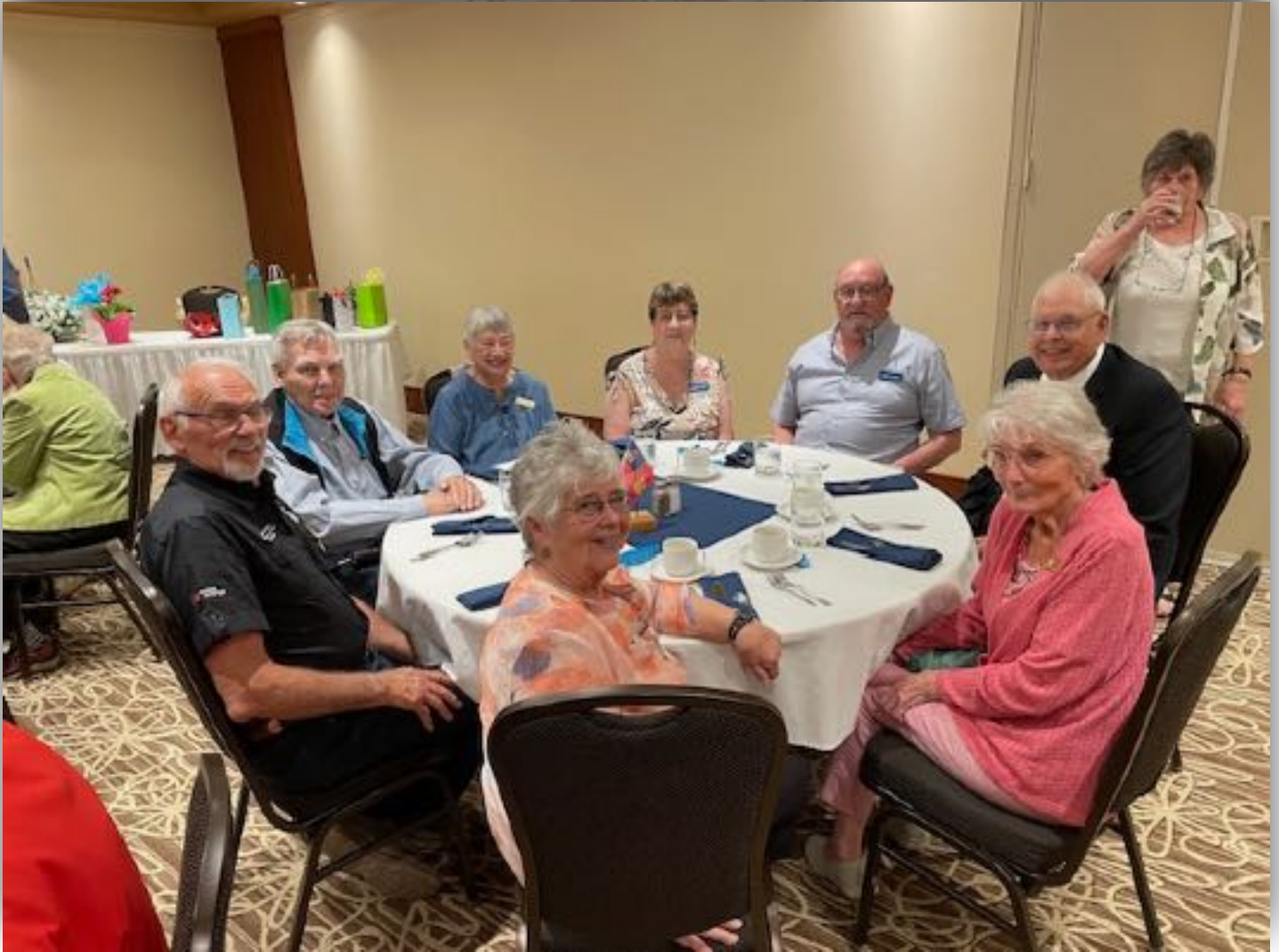
RCMP VETERANS ASSOCIATION DES Table 4 CENTRAL VANCOUVER ISLAND DIVISION