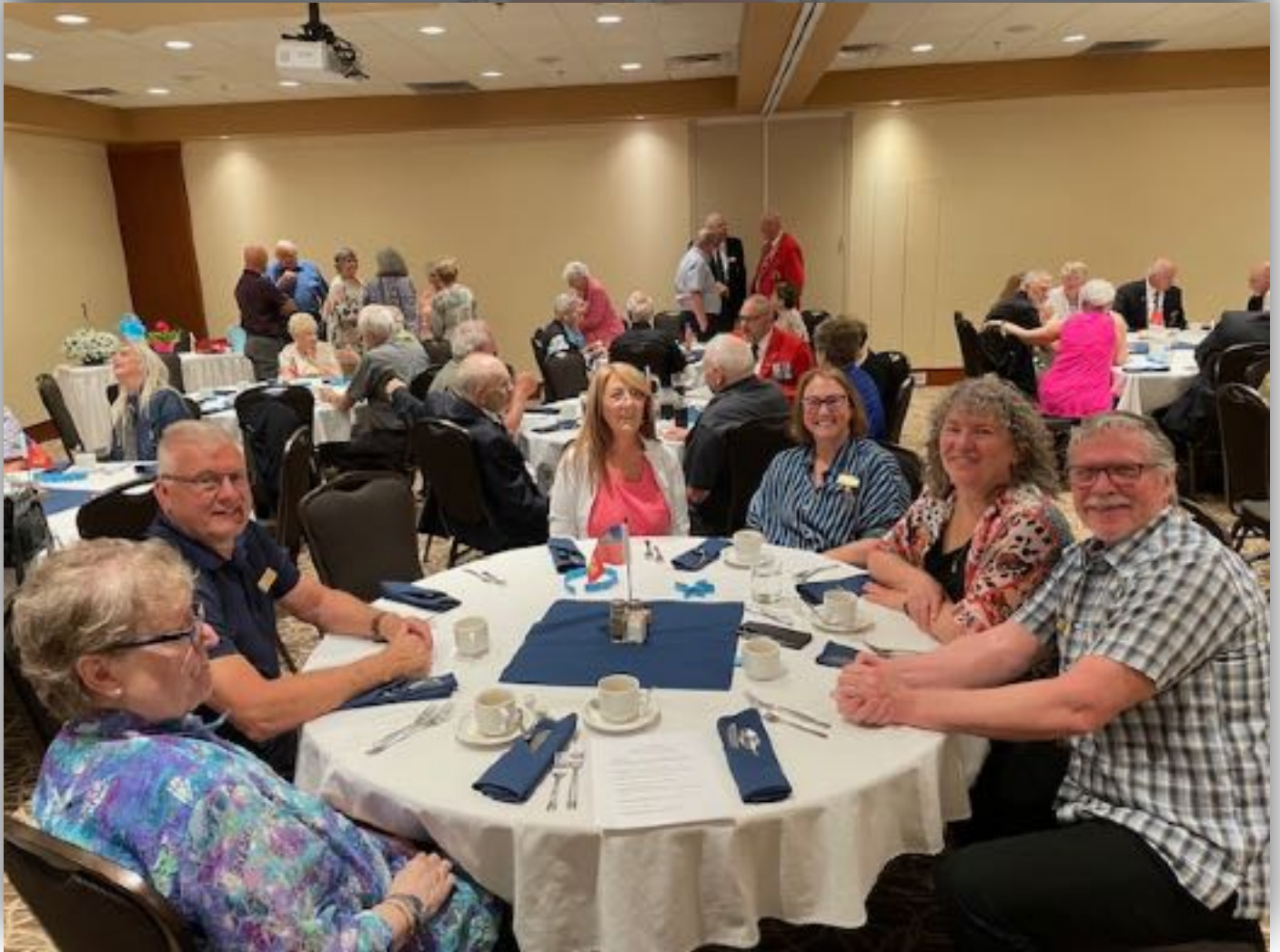
Table 3 CENTRAL VANCOUVER ISLAND DIVISION