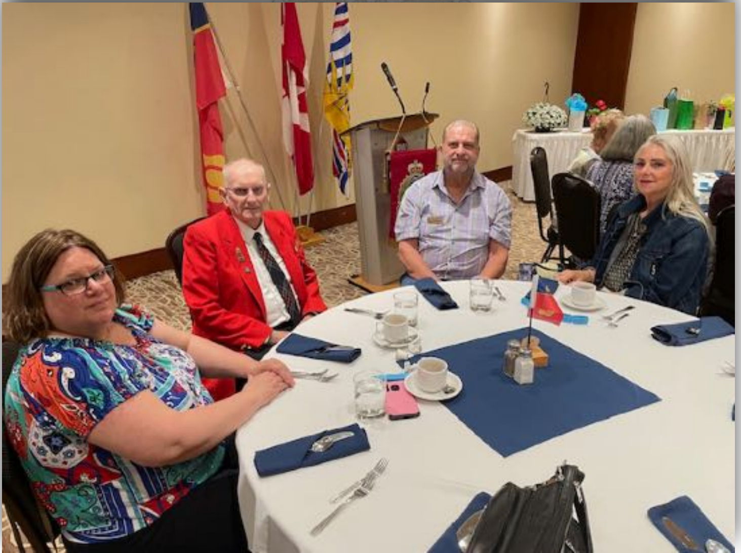
Table 7 CENTRAL VANCOUVER ISLAND DIVISION