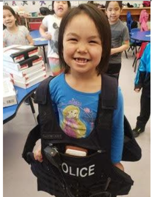
One of Geoff MaKay’s favourite photographs of a girl in Hall Beach