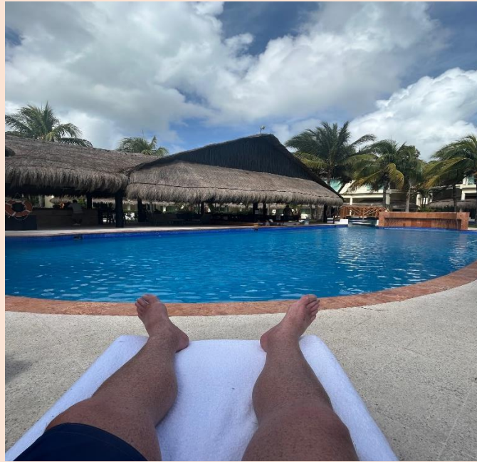
Photo #1 is the view from their suite, #2 shows a diehard Canadian from Alberta watching the Edmonton Oilers on the big screen and #3, well, presumably that is relaxation personified.