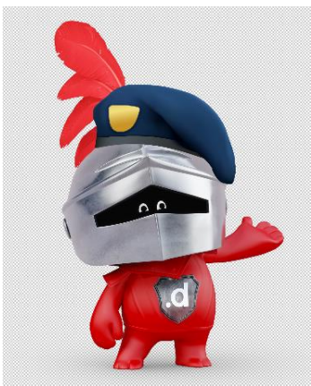
BELAIR DIRECT INSURANCE