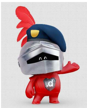
BELAIR DIRECT INSURANCE