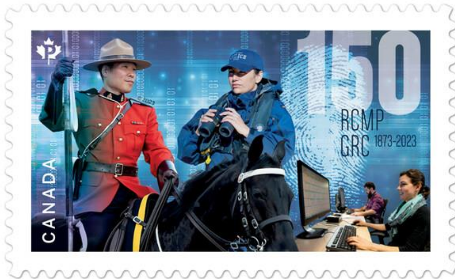
New stamp commemorates RCMP 150th Anniversary.