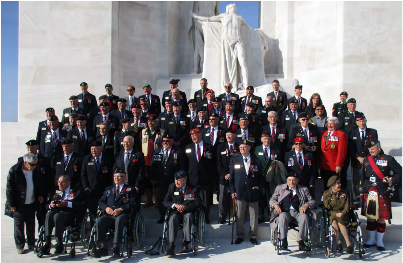
The Canadian delegation at the Vimy Monument