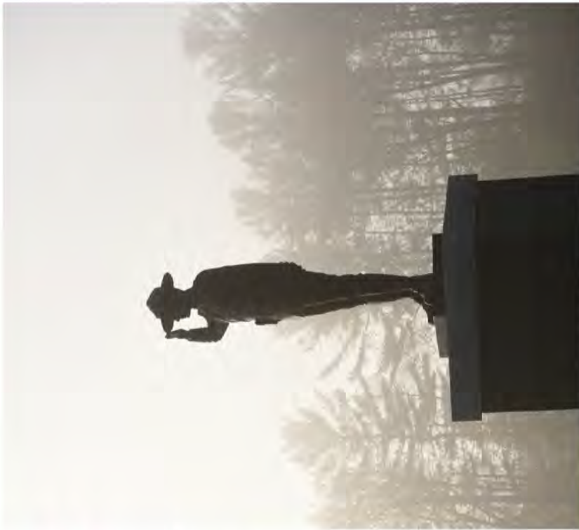
This cenotaph was placed in the RCMP National Memorial Cemetery, at Beechwood, Ottawa, to honour the memory of RCMP members who gave lives whilst in the performance of their duty.