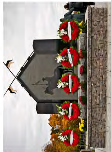
Main Monument in RCMP Designated Section