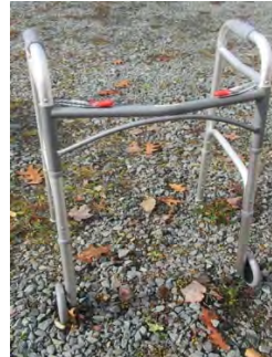
Aluminum walker – two front wheels

Other items include crutches, canes, walkers, toilet toppers, and wheelchairs.