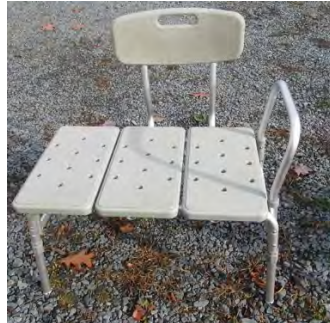
Bath Chairs – over tub edge

Failing that, there are other resources that can be tapped – from rentals to purchases though resources available to the RCMP Veterans’ Association. Any requests can go through the Region Directors or to the S&A Directors.