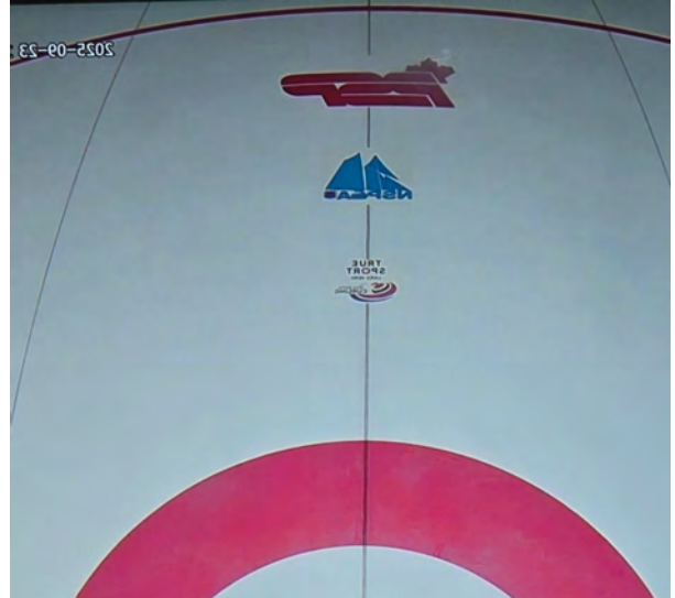
NSPCA Logo embedded in Ice at CFB Halifax CC