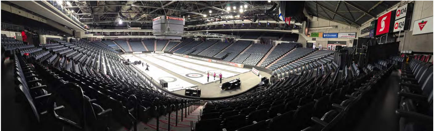
Getting the ice ready for the Nova Scotia Police Curling Championships.