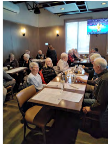
January 25th luncheon at the Lion's Head, Halifax.