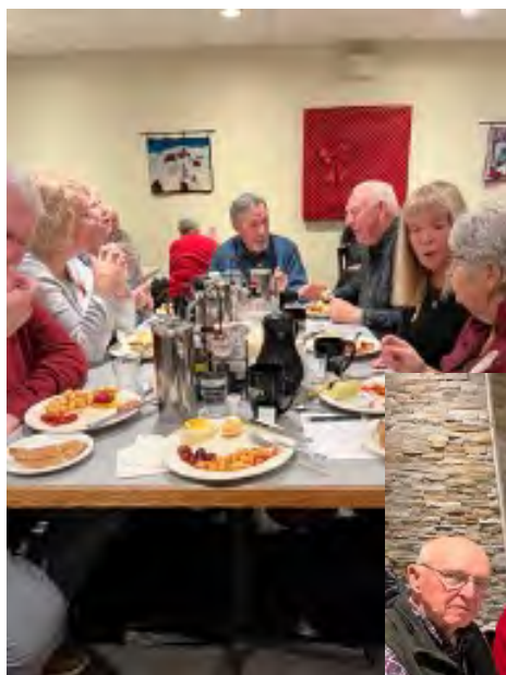
Cumberland District Christmas Breakfast, December 11, 2023 at Brittany's in Amherst submitted by Al Wellwood