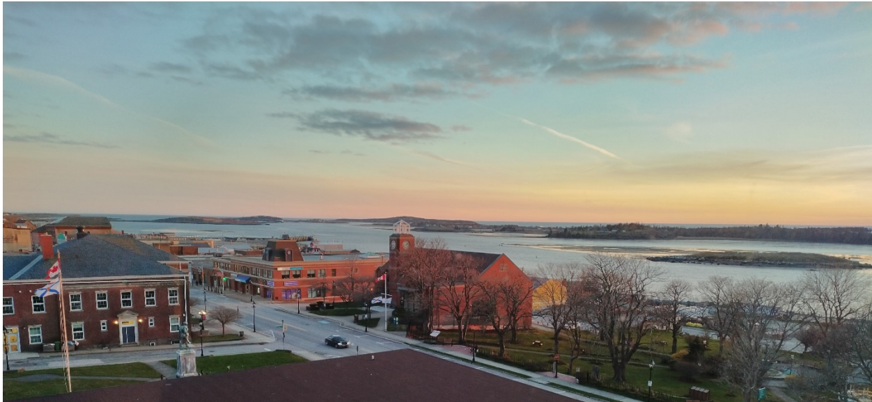
Sunset in Yarmouth - Town Hall and Frost Park along the Waterfront

On Tuesday, April 30 th the NS RCMP VA Executive and the Support and Advocacy Committee jointly conducted the first full-day Benefits and Information Workshop for 2024 at the Rodd Grand Hotel in Yarmouth.